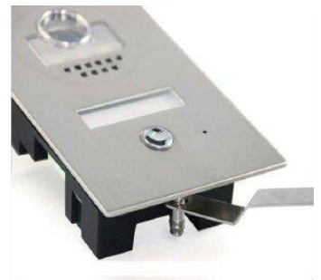
Invisible Mounting Nut

Specifications are subject to change without notice. Entry Vision is not responsible for any typographical errors.